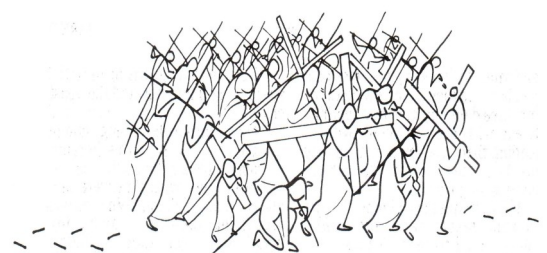
"... he must forget himself, carry his cross, and follow me." (8.34)

O most holy heart of Jesus, fountain of every blessing, I adore you, I love you, and with lively sorrow for my sins I offer you this poor heart of mine. Make me humble, patient, pure and wholly obedient to your will. Grant, Good Jesus, that I may live in you and for you. Protect me in the midst of danger. Comfort me in my afflictions. Give me health of body, assistance in my temporal needs, your blessing on all that I do, and the grace of a holy death. Amen.