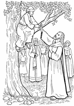
When Jesus passed through Jericho, Zacchaeus, a publican, who was too short to see Him through the crowd, climbed a sycamore tree to see Jesus.