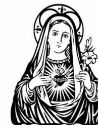
Our Lady of the Sacred Heart

Archdiocese of Birmingham Registered Charity 234216